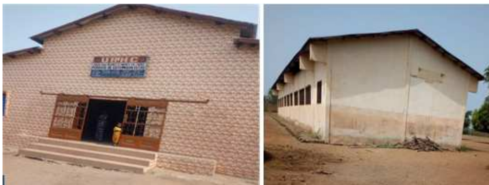
Plate 3: Human Buildings (A Church Chapel and A Class Module) in the middle of the Classified Forest.