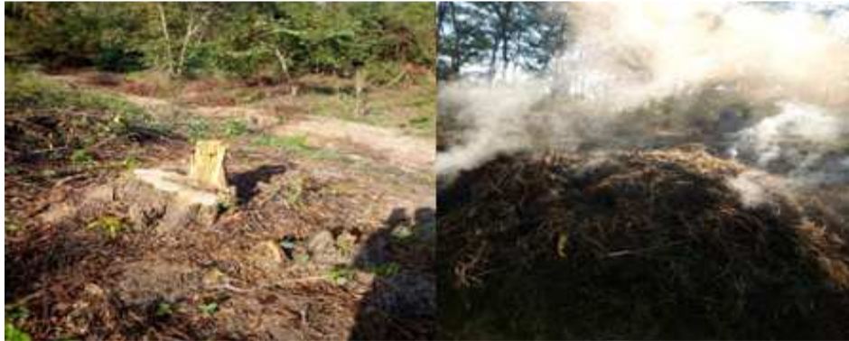
Plate 1: Cutting Trees and Charcoal making in the Middle of a Classified Forest. Shooting: Tchaou, December 2018

This picture shows the cutting and charcoal making.