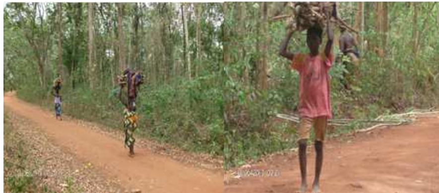
Plate 2: Collection and Transport of Firewood to Supply the Wood Markets. Shooting: Tchaou, January 2019