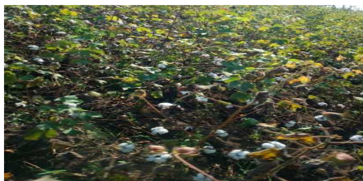
Photo 1: Cotton Field Inside the Classified Forest. Shooting: Tchaou, December 2018

Photo 1 shows a cotton field in the forest with the use of pesticides. The packaging of these pesticides is discarded without any environmental protection measures by the users.